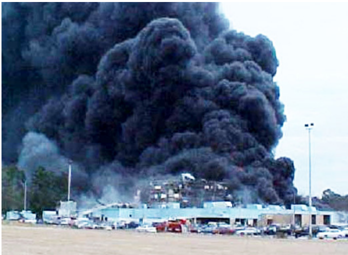
A fire burns following an explosion of fine plastic powder.

In North Carolina, an explosion of fine plastic powder used in the manufacture of polyethylene products killed six people and injured 38. In Pennsylvania, wood dust in a particle board manufacturing plant explosion killed three and injured 10. In Mississippi, rubber dust exploded in a rubber manufacturing plant, killing five and injuring 11. Also, in Kansas, a series of wheat-dust explosions in a large grain storage facility resulted in the deaths of seven people. Accident investigators in each of these facilities, although different industries, found similar conditions that resulted in a massive, tragic dust explosions.