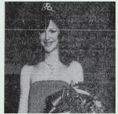
A newspaper clipping from the Detroit Free Press announces the winner of Mrs. Michigan as a 31-year-old mother of six from Southfield.