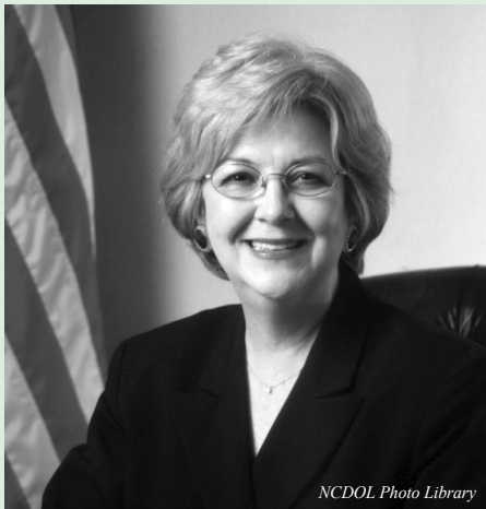
The first photo appears in black and white on elevator certificates across the state in 2005. The photos were added as annual inspections were conducted.