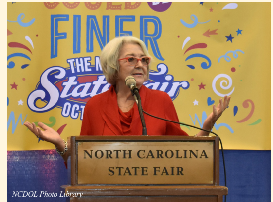
Labor Commissioner Cherie Berry speaks about the importance of ride safety and the inspections done by the department's Elevator and Amusement Device Bureau while in the Dorton Arena on Media Day Monday, Oct. 14.

This gigantic wheel was brought in on 12 trucks and took 14 workers five days to assemble. The statistics on this device are impressive enough, but the view is even more astonishing. It is said that from the tiptop of the wheel you can see for 15 miles on a clear day. The SkyGazer's operating system is also computerized, allowing each patron's ride time to be equal. This also ensures that ride operators can safely load and unload riders from the wheel.