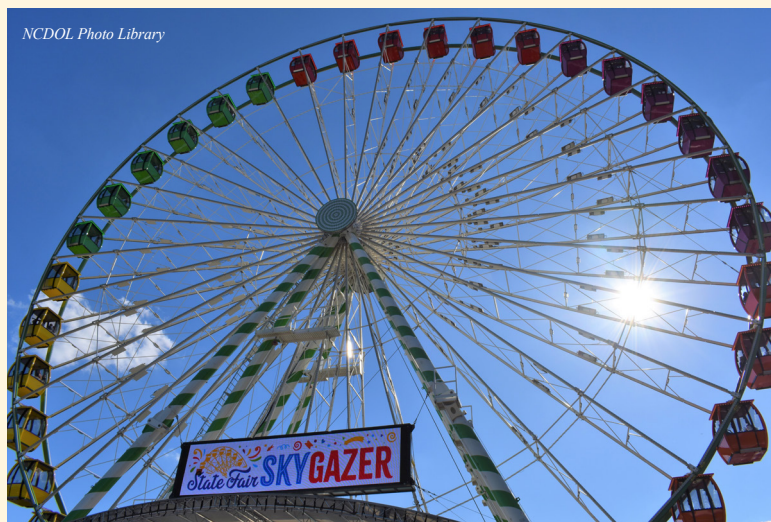
The State Fair SkyGazer stands at 155 feet on a clear, sunny day at the N.C. State Fair.

The fair came to town with three new amusement devices this year including the Frenzy, the Dream Wheel and one of the most eye-catching attractions, the State Fair SkyGazer. It is the tallest traveling Ferris wheel in North America, standing at 155 feet and weighing 400,000 pounds.