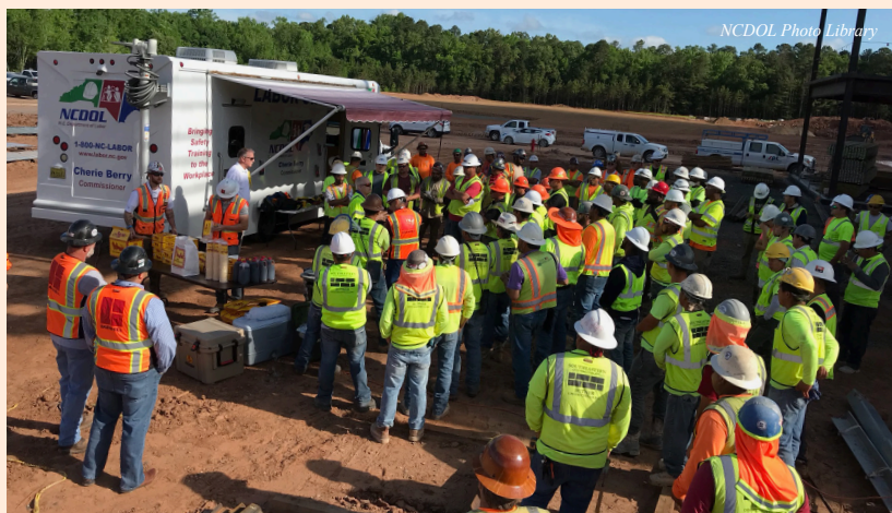
Construction workers with Barnhill Construction Co. gather in front of Labor One, the NCDOL mobile classroom, for a stand-down training event in Cary Monday, May 7, 2018.