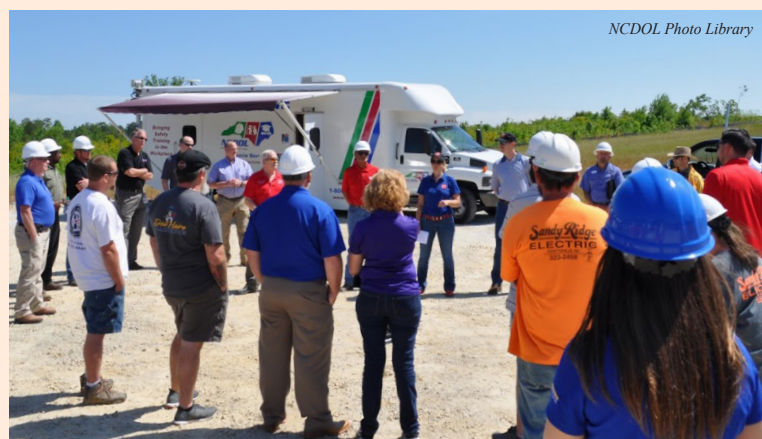
Builders Mutual Insurance Co. sponsors a stand-down training session to prevent falls with H&H Constructors in Fayetteville Tuesday, May 8, 2018. Hands-on training on fall protection was provided to workers inside Labor One.