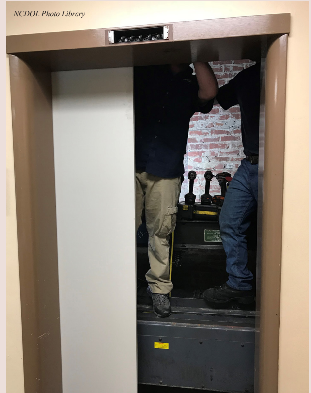
Crews from Bar Construction and Elevator Specialists of Carolina install a digital operating system on the elevator in the Labor Building.