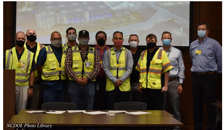
Officials from NCDOL and Holder - Edison Foard - Leeper a Joint Venture pose for a photo in front of a projection of the Charlotte Douglas International Airport expansion project. Labor Commissioner Dobson attended the ceremony that began the partnership between the two parties on Wednesday, Sept. 1.

NCDOL and HEFL signed the convention center safety partnership on Oct. 28, 2020. The Labor Department's Occupational Safety and Health (OSH) Division worked with HEFL while providing guidance to improve employee safety and health, reduce injuries and illnesses, increase access to training and information, and develop safety and health management systems.