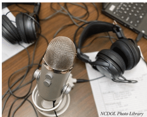
NCDOL Photo Library

NCDOL currently has alliances with seven organizations in the state, including the Mexican Consulate. For more information on alliances, visit the NCDOL website . You can find resources for Labor Rights week on the USDOL website .