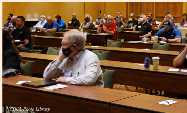
Participants in the 2021 N.C. Mine Safety and Health Conference gather at Harrah's Cherokee Hotel and Casino to listen to speakers, share best safety practices and gain insight into updated mine technology from Sept. 8–10 in Cherokee.

Next year's conference is scheduled for Sept. 14–16, 2022, at the Double Tree in Atlantic Beach. For information on the Mine and Quarry Bureau, or to sign up for training, visit the NCDOL website or call 919-707-7932.