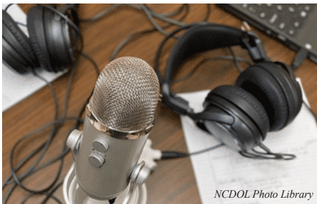
NCDOL Photo Library

So, on Dec. 8, from noon to 3 p.m., in front of the Labor Building, located at 4 W Edenton St., drive by or walk by and drop off a new toy.